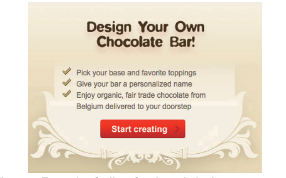
Figure 5. Example of a list of tasks to help the consumer set clear goals (Chocri).

Examples: Shutterfly offers overarching creative goals to the customer. The site suggests reasons for the consumer to undertake the task of creating a photo book on the site based on knowledge of and expectations about the intended consumers, "Photo books are the best way to preserve and share memories" (Shutterfly). Chocri, a chocolate customization site visualizes the process from creation to delivery on their home page, "Pick your base and favorite toppings, give your bar a personalized name, enjoy organic fair trade chocolate from Belgium delivered to your doorstep" (Chocri, see Figure 5). The goal and final deliverable are clear for the consumer before they begin the creation task.