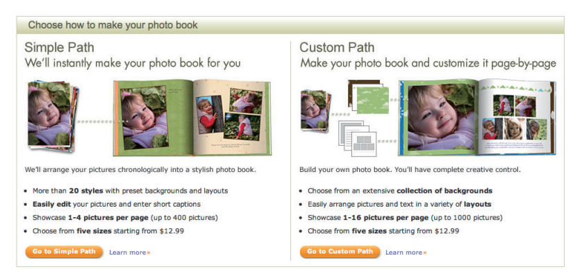
Figure 2. Example of offering autonomy through choice of development pathway (Shutterfly).

Examples: Shutterfly, another online photography selfservice, offers two separate entry points for consumers to choose their own path: Simple for consumers who want more of a guided experience through the customization process, and Custom where the consumer has more control over the development of their photo book (see Figure 2). This is also another example of providing optimal challenge for the consumer (see Principle 1), though the consumer is gauging their own experience point rather than the software itself.