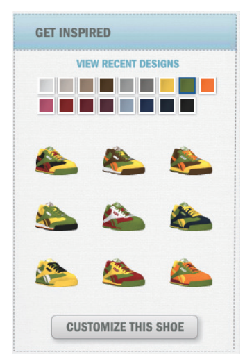
Figure 3. Example of encouraging a community of users through sharing user designs (Reebok).

Examples: On the Reebok online custom shoe service, consumers are encouraged to "Get inspired" by viewing recent customized shoes created by other users (Reebok). Similar user interests are emphasized in this process, such as when the consumer makes an initial color choice and shoes from other consumers that use related colors are showcased (see Figure 3). They can actually build on the template of others. Once the