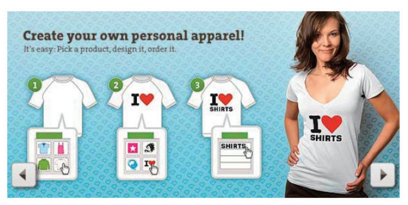
Figure 7. Use of symbols as an example of inducing positive affect (Spreadshirt).

Positive imagery may be used as well. Spreadshirt, an apparel customization service, encourages consumers to create a personalized t-shirt by showing an example featuring a prominent heart shape (see Figure 7).