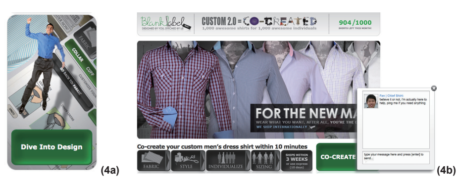
Figures 4a. and 4b. Examples exhibiting the encouragement of risk-taking within a safe environment (Blank Label).

learn more when in environments that promote psychology safety or an atmosphere in which experimentation is viewed as a means to learning rather than failure (Edmondson, 1999).