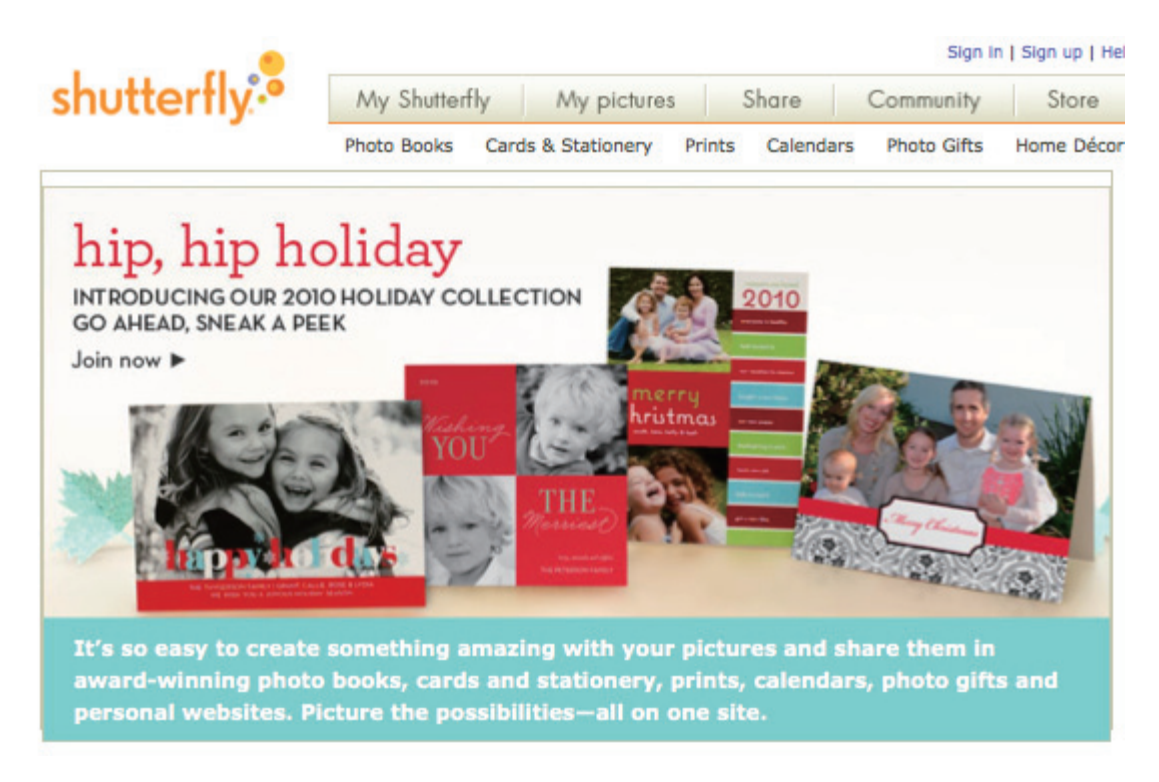
Figure 6. Use of photographs as an example of inducing positive affect (Shutterfly).

Example: Photography-related customization self-services are naturally designed to support positive affect through the use of photographs. Shutterfly includes abundant pictures of happy children and families. In Figure 6, photographs are used as motivation, placing photographs of happy children alongside text suggesting the idea of creating a holiday card as a way to preserve memories to a customer base that includes many women of a parenting age.