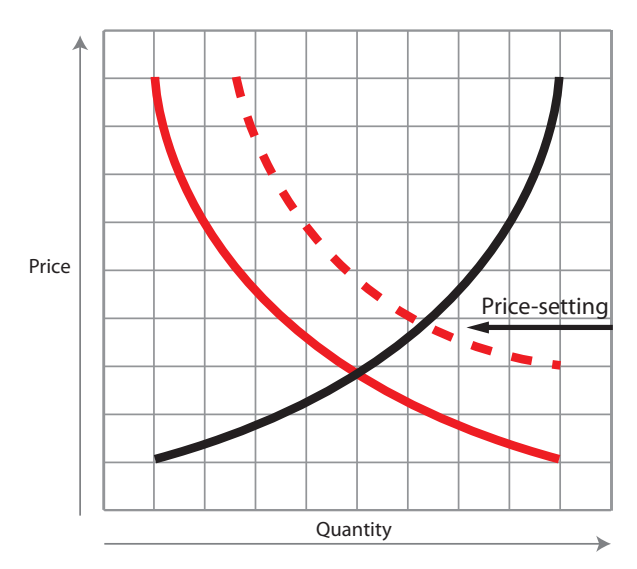
Figure 3. Price-setting replacing the interplay of supply and demand.

market; and fourthly, markets are depicted as static, but in fact are constantly changing in innumerable ways.