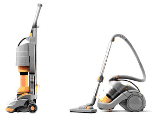
Figure 4. Dyson DC01 and DC02 vacuum.

This clearly positions design outside the parameters of Neo-Classical theory. Yet in reality, many companies function as price-setters —targeting people who will willingly pay more for products embodying superior qualities. James Dyson's first vacuum cleaners (Figure 4) introduced in Britain in 1993 were double the price of his cheapest competitors. Yet against established multi-national companies, the superior performance of his start-up products attained market leadership in the UK inside two years, an achievement subsequently mirrored in other markets.