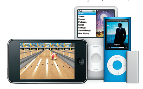
Figure 8. Varied manifestations of the iPod line: the screenless iPod Shuffle, iPod Nano, iPod Classic, and iPod Touch.

A classic contemporary example is the way Apple created a new market with the introduction of its iPod and the iTunes system in late 2001, which revolutionized the retail music business. Despite intense competition from imitators around the globe, it has maintained its superiority due to consistent development of the product range, the continuing quality of its technology, and the strong design identity that characterizes it. By March 2008, over 150 million iPods had been sold worldwide, making it the best-selling digital audio player series ever. It is neither the cheapest, nor even the most technologically advanced product of its kind, yet it has a dedicated following locked into to what they believe is its innate superiority. It is surely one of the most compelling contemporary examples of the power of design when embedded in the culture of a business in all its aspects (iPod, n.d.).