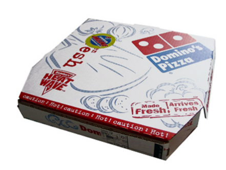
Figure 5. This range of American consumer products has images which, in essence, change very little over time.

based on goods which already exist, there is little left on which to focus beyond price and quantity.