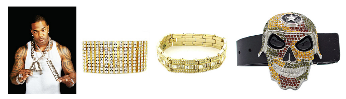
Figure 7. American Hip-Hop musician Busta Rhymes and on-line jewellery company HipHop.com exemplify the trend known as "bling-bling", a variation of conspicuous consumption that strikingly asserts the identity of inner-city African-Americans through elaborately decorative and often exotic forms.

Another important contribution of Institutional theory has been on the subject of the firm. "The Nature of the Firm," a landmark paper in this direction written by Ronald Coase in 1937, questioned Neo-Classical arguments that the price mechanism