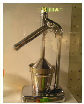
Figure 6. Four very different lemon squeezers in term of materials, form, cost, and taste.

(1949), action is only comprehensible in terms of the ideas that generate it. "Human action," he wrote, "is purposeful behavior" (p. 11). Its aim is change to achieve improvement in some way.