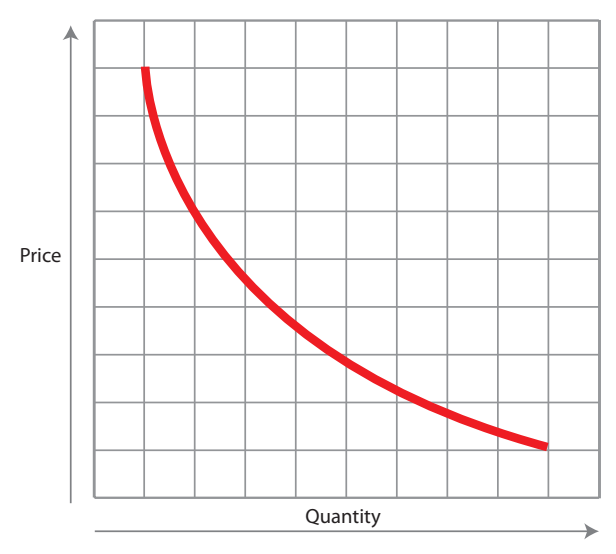
Figure 1. Supply.