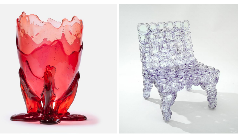
Figure 1. Designers push for novel forms by challenging the existing associations of plastics with "unified" and "perfect" machine-made forms: left, Clear Vase by Gaetano Pesce; right, Fresh Fat easy chair by Tom Dixon, 2001.

With the advancement of smart and computational materials, the temporal dimension of form has gained prominent attention, and is termed temporal form (Vallgårda, Winther, Mørch, & Vizer, 2015). Temporal form in so-called computational composites is enabled by the computational structure, and materials enable the "material manifestations of temporal forms that enable our interactions with computational things" (p. 1). The temporal dimension of physical form, however, does not have a causal relation with computation, meaning that materials do not always