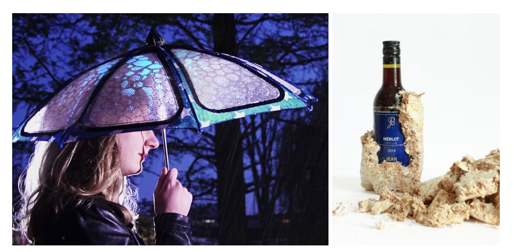
Figure 6. The experiential potential of materials: left, the umbrella pushes for a novel experience of rain, through the custom-made water-activated EL print (designed by Stan Claus; image source: Weirsma Brothers; reprinted with permission); right, mycelium-based packaging design, by Davine Blauwhoff, offers a distinct unboxing experience (reprinted with permission from Davine Blauwhoff).

view that material potentials are materials' ever-existing effects awaiting the creative mind to recognize them, independent of the fluxes of the creation process, the designer's skills, the properties of the medium used to communicate the material (e.g., technical information, video of the making process, the processed material, or the ingredients), the social context (who the designer interacts with), time, and place (what equipment the designer has access to).