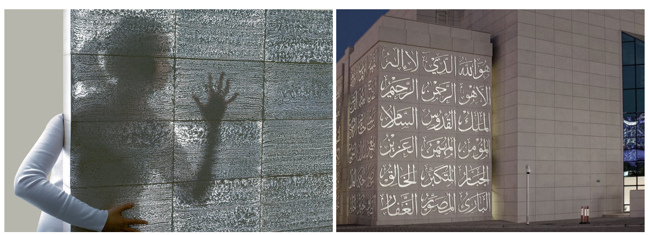
Figure 12. The previous practice of collaging glass and concrete materials next to each other is transgressed in the creation of light-transmitting concrete: left, precast building blocks by Litracon® (image source: Litracon®; reprinted with permission); right, Al-Aziz Mosque's light-transmitting façade (design, production, and photo by LUCEM Lichtbeton®; reprinted with permission).

and serVies by Annemarie Piscaer & Iris de Kievith). These creative practices with and through materials challenge the norms and conventions ascribed to materials, including their sociocultural meaning and their use. For instance, a realization of the potential of animal blood, discarded in large quantities by slaughterhouses, as a material source triggers Stittgen to further explore its "material-ability." The designer exploits the known affordances of blood (e.g., to dry) to process it into a powder that can then be heated and pressed into a black, solid material. The process uncovers and exploits novel affordances of blood, or more specifically albumin protein, to act as a binding agent, in creating a protein-based biopolymer that is 100% processed blood.