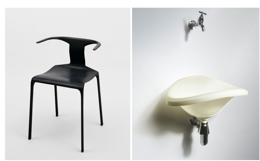
Figure 5. Understanding material potentials in relation to the experiences and performances elicited in interactions with products: left, Light Light chair by Alberto Meda; right, Soft Washbowl by Hella Jongerius, (production by Droog Design). Image source: left, Hella Jongerius; right, Museum of Modern Art, New York; reprinted with permission.

So far, we have shown how materials potential can be conceptualized in relation to the notions of form, function, and (materials) experience. Even though these notions are conceptually separated, in reality form, function, and experience as materials potential are rather intertwined, as they affect and result from each other. For example, a material might simultaneously enable surprisingly (i.e., experience potential) thin yet strong shapes (i.e., form potential) to sit on (i.e., function potential). However, such understandings of materials potential do not reflect how novel material potentials actually come about in creative practice. This may reinforce the