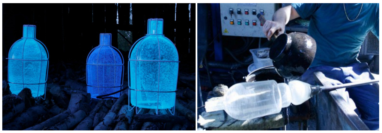
Figure 11. Designers exploit the potential for embedding photoluminescent pigments into the transparent body of glass, using a traditional technique: left, Trap Light by Gionata Gatto and Mike Thompson; right, Murano glass blowing process.