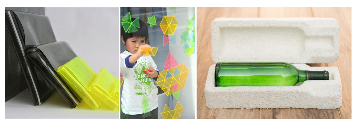
Figure 4. Materials potential can be articulated in relation to materials' structural and functional roles in product applications: left, Furoshiki Shiki, and middle, San Kaku Mado (triangles), made of sticky vinyl film, by Samira Boom (image source: left, Christien van Dokkum; middle, Nakano Ougi; reprinted with permission); right, wine packaging and photo by Ecovative (reprinted with permission).

Materials as the building blocks of products, charged with (sociocultural) meanings (Karana, 2009; Wilkes et al., 2016) play an important role in shaping our experiences of products (Karana, Hekkert, & Kandachar, 2008; Karana, Pedgley, & Rognoli, 2014). Ashby and Johnson (2002) acknowledge that the mechanical