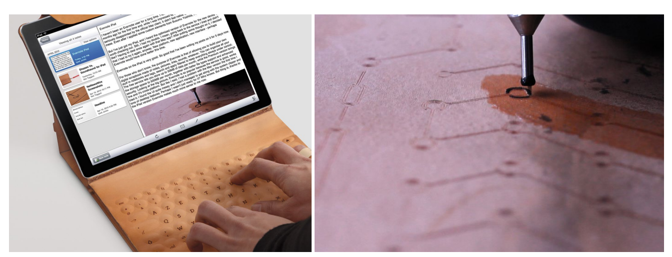
Figure 7. A novel potential of leather is unlocked through the skillful act of tattooing with conductive ink: left, iPad cover and keyboard INKO; right, the leather being tattooed with conductive ink (design and photo by Alexandre Echasseriau; tattooing by Tatoué and Jeremy Lorenzato; conductive ink: Bare Conductive; reprinted with permission).

Affordances as Materials Potential: What Design Can Do for Materials Development