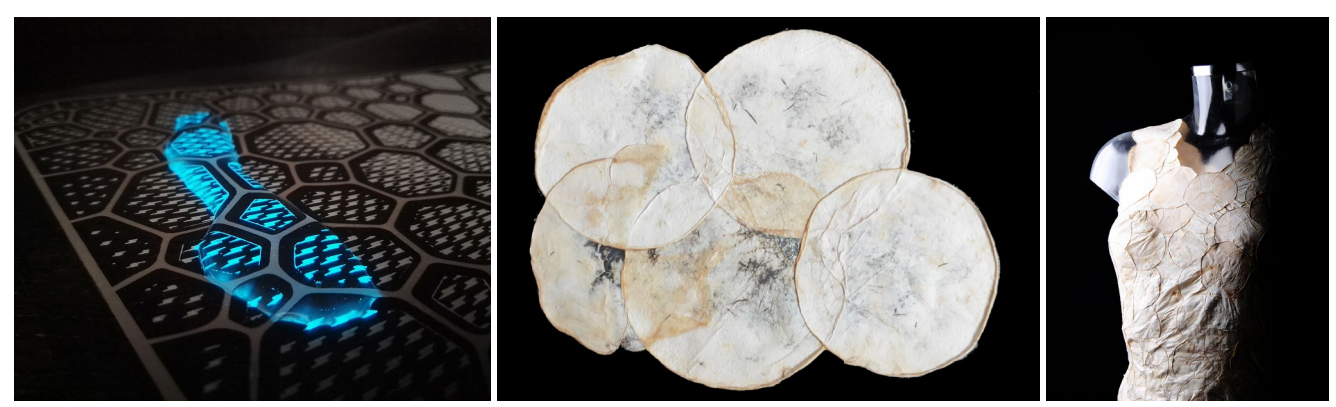
Figure 9. Discovery and perception of new affordances through materials experimentation: left, water-activated electroluminescent sample (design, fabrication, and photo by Stan Claus; reprinted with permission); right, MycoTEX textile and dress made from aggregated pure mycelium pieces by Aniela Hoitink | NEFFA (image source: Aniela Hoitink | NEFFA; reprinted with permission).

Invention of new tools/machines and repurposing, modifying, and combining existing production tools and techniques have been key to expanding novel affordances (for an overview, see Rognoli et al., 2015). The development of new machines such as multimaterial 3D printers has enabled high-resolution control over dot deposition of soft, rigid, and transparent plastics in a single printed material. MIT Self-Assembly Lab showcased the possibilities of creating multi-material prints that can change shape "directly off the print bed" and termed this new way of production "4D printing" (Tibbits, 2014). New ways of production such as 4D printing have further opened up unprecedented design opportunities in terms of form and experience, see for instance shape-shifting noodles by