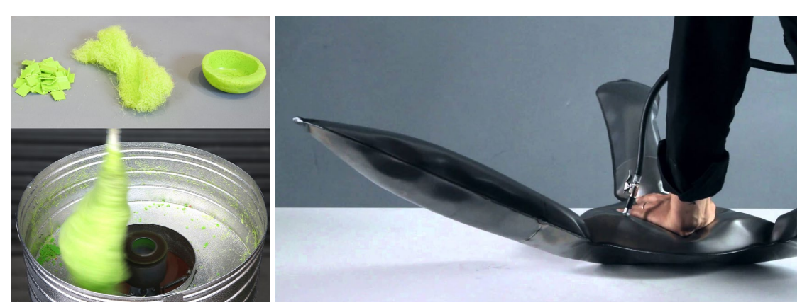
Figure 10. Repurposing and inventing tools and techniques may unlock novel material affordances: top left, fiberized and molded polypropylene waste; bottom left, Polyfloss Machine by A. Gaulard, N. Paget, C. Machet and E. De Visscher, Royal College of Art, London, 2012 (image source: The Polyfloss Factory Ltd.; reprinted with permission); right, metal inflating by Oskar Zieta, 2011 (image source: Zieta Prozessdesign; reprinted with permission).

Another instance of transgressing norms in material-driven design practices is searching for and discovering unorthodox material sources, such as waste animal blood (by Basse Stittgen), and urban smog (e.g., Smog Free Ring by Studio Roosegaarde,