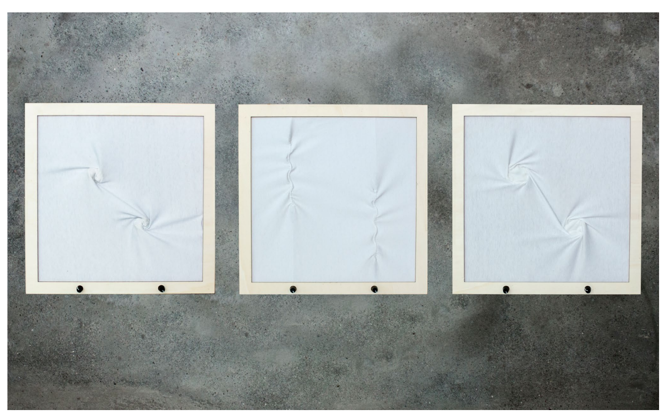
Figure 1. The three boxes, the left-hand one powered by two stepper motors, the middle one by two helical strings of shape-memory alloy, and the right-hand one by two servomotors. All three boxes are 20 inches in length and width and four inches high. See also the temporal forms in action at https://vimeo.com/album/3639572.

choosing two similar actuators (the two types of rotating motors) was because, even if they technically perform similar rotations, the possible patterns of those movements would be different. This would allow us to explore whether the experienced temporal forms would also be different. Furthermore, we chose movements in a physical material over more traditional forms of expression in a computational thing, such as graphics on an LCD, light patterns in LEDs, or audio. The reason was a desire to explore that part of the design space where the instantaneous state changes that we have come to expect from traditional computational things would be suspended. Through removing this expectation we would be able to explore a larger range of expressions in which, for instance, transitions between states could play an important role. Finally, we chose two actuators per box. One actuator per box would have been a simpler choice but we quickly realized that the temporal forms would soon become too monotonous. Two actuators, on the other hand, would allow us the interplay between them and the use of the temporal form elements of synchronicity and asynchronicity.