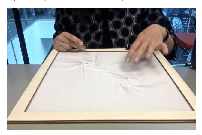
Figure 3. One of the study participants explaining her experience of a form developing through the servomotor setup.

We would alternate between starting with the servomotor and the stepper motor but would always have the SMA in the middle as a means to clear the palate and ensure the session would not become too monotonous. We would also keep the order of the temporal forms for each box as they are described in the section above. The argument here was that there is a learning curve in how the boxes work and the first temporal form was the easiest to understand. While confounding of the experimental setups is probably inevitable it does not really matter since we were not interested in particular temporal forms but rather in the experts' expressed experiences and their own explanations.