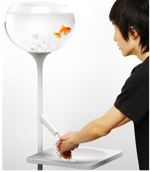
Figure 3. Poor Little Fish (2009) by Yan Lu. Reprinted with permission.