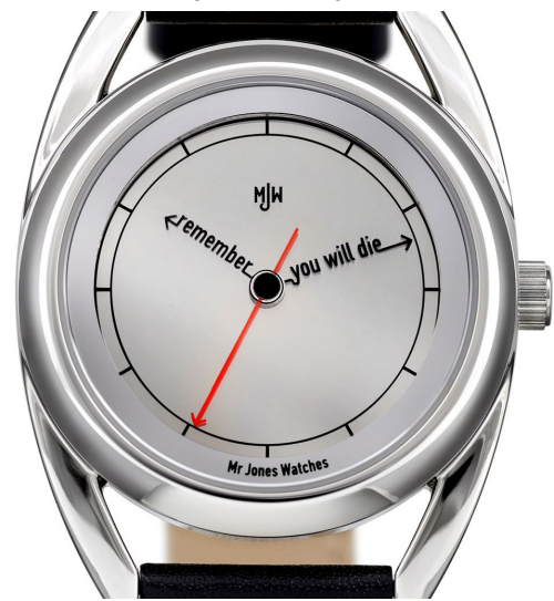
Figure 2. The Accurate (2007) by Crispin Jones. Reprinted with permission.