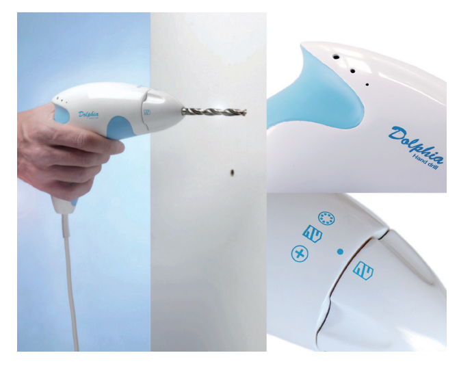
Figure 13. The drill "Dolphia."

The drill's product language is inspired by a dolphin's anatomy (Figure 13), hence the name Dolphia Drill. The dolphin is a gentle animal that is often seen as having human-like characteristics. The drill is white and light blue, with a glossy surface to urge caution and care in handling. The body shape is unitary and reveals nothing of the motor inside. The vents are decoratively placed some distance away from the engine to minimise the expression of the device's performance. For this reason, even the power switch is integrated into the pan, and it is concealed by a decorative rubber panel. The feeling conveyed during use should be that of 'hugging out' the power and should require minimal strength. The chuck is easy to hold, and there is no need for a key when changing the drill bit. Clear symbols help the user determine which settings should be used for different purposes. The drill is limited to three drill bits of different sizes.