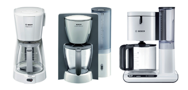
Figure 7. Bosch coffee makers. From left to right: the more performance, the more straight forms and darker colours. Product photos are printed with permissions by Bosch, all other rights reserved.