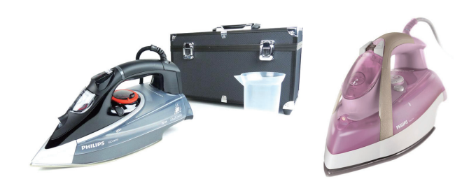
Figure 9. Philips irons. The one on the left is described in terms of performance, and the one on the right in terms of utility.

The research approach is inspired by Research through Design (RtD) (Frayling, 1993). RtD generates knowledge by designing innovative artefacts, models, prototypes, products, concepts, etc., and evaluates them by conducting various experiments (tests, perception experiments, etc.). It approaches the world of (research) objects primarily from the perspective of 'designability' (and changeability), and thus arrives at new ideas.