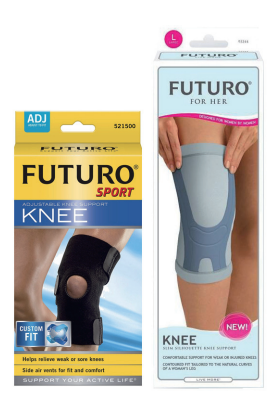
Figure 5. Futuro knee protection, sport selection to the left and selection 'for her' to the right.

The product language is also strengthened by an often emotionally-charged name, based on the value system's principles. The separation principle is especially clear in products within the hygiene industry, where products targeted at women have names that refer to softness, intimacy, emotions, and childishness. Examples of such product names are the perfume Sexual Sugar from Michel Germain, the epilator Silk-épil Soft from Braun, and the watch Baby J from Casio. The men's collections stand in contrast, with names that can be associated with characteristics such as precision, strength, challenge, and intellect. Examples of which are the shaver Smart Touch from Philips, the fragrance Adventure from Davidoff, and the energy drink Monster . Intellect, strength, and adventurousness are characteristics that are prized in Western society, while intimacy, emotions, and naivety are less so (Kessler & McKenna, 2006).