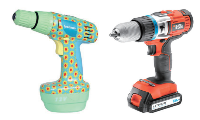
Figure 10. A screwdriver from Rusta (left) and a screwdriver from Black & Decker (right).

The concept of the design process follows Derrida's (1978) deconstructivism, which aims to make the invisible visible. Derrida focuses on text and argues that language can be likened to a 'filter' through which we see 'reality'. We cannot perceive reality directly, but can only understand it through the words we have to describe it. Everything we read, see, think, feel, and so on is a kind of 'text' that we interpret. The term text is thus used in a broad sense and refers not only to written texts, but also to the product language of the things that surround us. Deconstruction can be described as a kind of liberating interpretation of 'texts', which tries to uncover hidden meanings and give them new life and meaning through reinterpretation and placing them in new contexts. One way to do this is to put things in opposite relation to each other, because our relationship with them then changes and offers new perspectives (Derrida, 1978). Moreover, the design process is influenced by the design method "(Re)designing the characters of artefacts" (Krippendorff, 2006, p. 232), which suggests a way for designers and stakeholders to liberate themselves from the linguistic construction of product language. The method implies that by putting characters in opposite relation to each other, it becomes clear how we value them, thus enabling us to re-evaluate them.