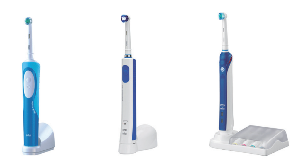
Figure 6. Braun electric toothbrushes. From left to right: from simple and cheap technology ("feminine" product language) to advanced 'professional' and more expensive technology ("masculine" product language).