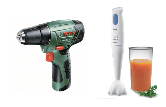
Figure 11. Drill/screwdriver from Bosch (left) and hand blender from Braun (right). Product photos are printed with permissions by Bosch and Braun, all other rights reserved.

For this study we chose two products: A drill and a hand blender. The following analysis of the product language takes as its starting point existing examples of these products against the background of the beliefs about 'male' and 'female' technology (Berner, 2003; Faulkner, 2000; Wajcman & Mackenzie, 1999). There are a variety of drills and hand blenders in the market. A drill/screwdriver from Bosch (Figure 11, left) and a hand blender from Braun (Figure 11, right) were selected because, even if they are unique in a sense, their product languages represent typical examples of these product categories.