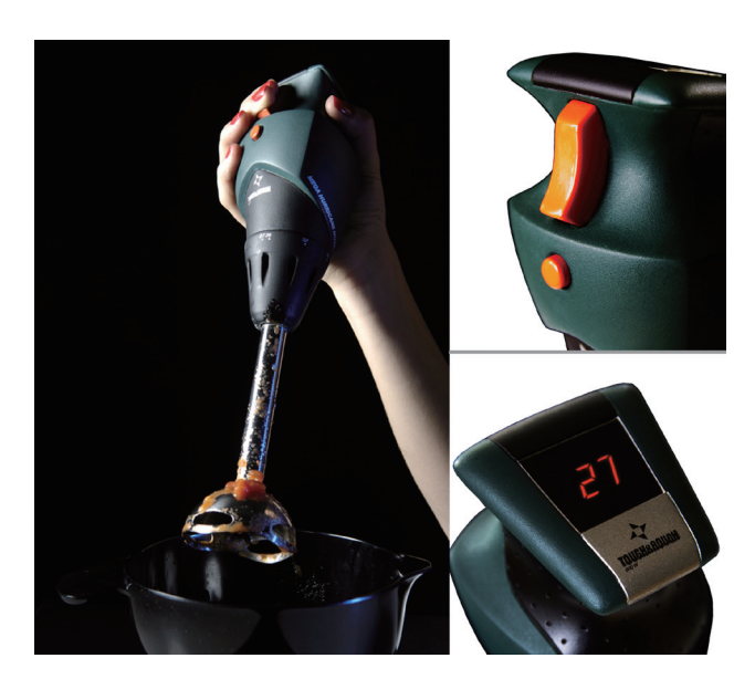
Figure 12. The mixer "Mega Hurricane."

In the design proposal, the hand blender (Figure 12) has a larger size than the technology inside requires, giving a feeling that this is a robust product with a strong engine. The designs are inspired by an eagle – a formidable animal that symbolises precision and speed. External colour differences and different surface materials give it a complex and exclusive appearance. The message here is that this is a product that can withstand shock and rough handling, which is why it is composed of durable materials, has a matte finish and dark colours. The handgrip gives the idea of being ergonomic and heavy, and it has a surface that appears to increase grip sensation. The switch is designed like a trigger; it is orange and stands out visibly to illustrate that this is a 'product of power'. It is designed in such a way that the grip is similar to the grip of a gun – an artefact that is targeted and dangerous. The hand blender has, at the top, a display that shows the power setting in luminous figures. This allows the user to easily monitor power and have more control. Finally, a rotary blade is fastened in a 'chuck', which is adorned with ostentatious digital characters. The idea is that the rotary blade can be changed for different purposes so as to enable greater flexibility and creativity.